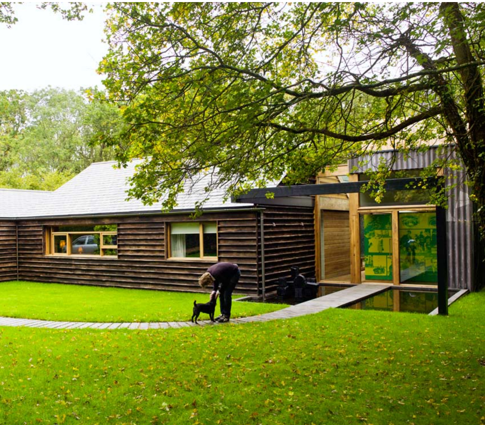
ABOVE Lincoln greets their dog, Little Susie. He chose burnt-larch cladding to blend into the natural surroundings. In time it will 'disappear' into the forest. A sweep of concrete paving curves up to the front door over a still pond