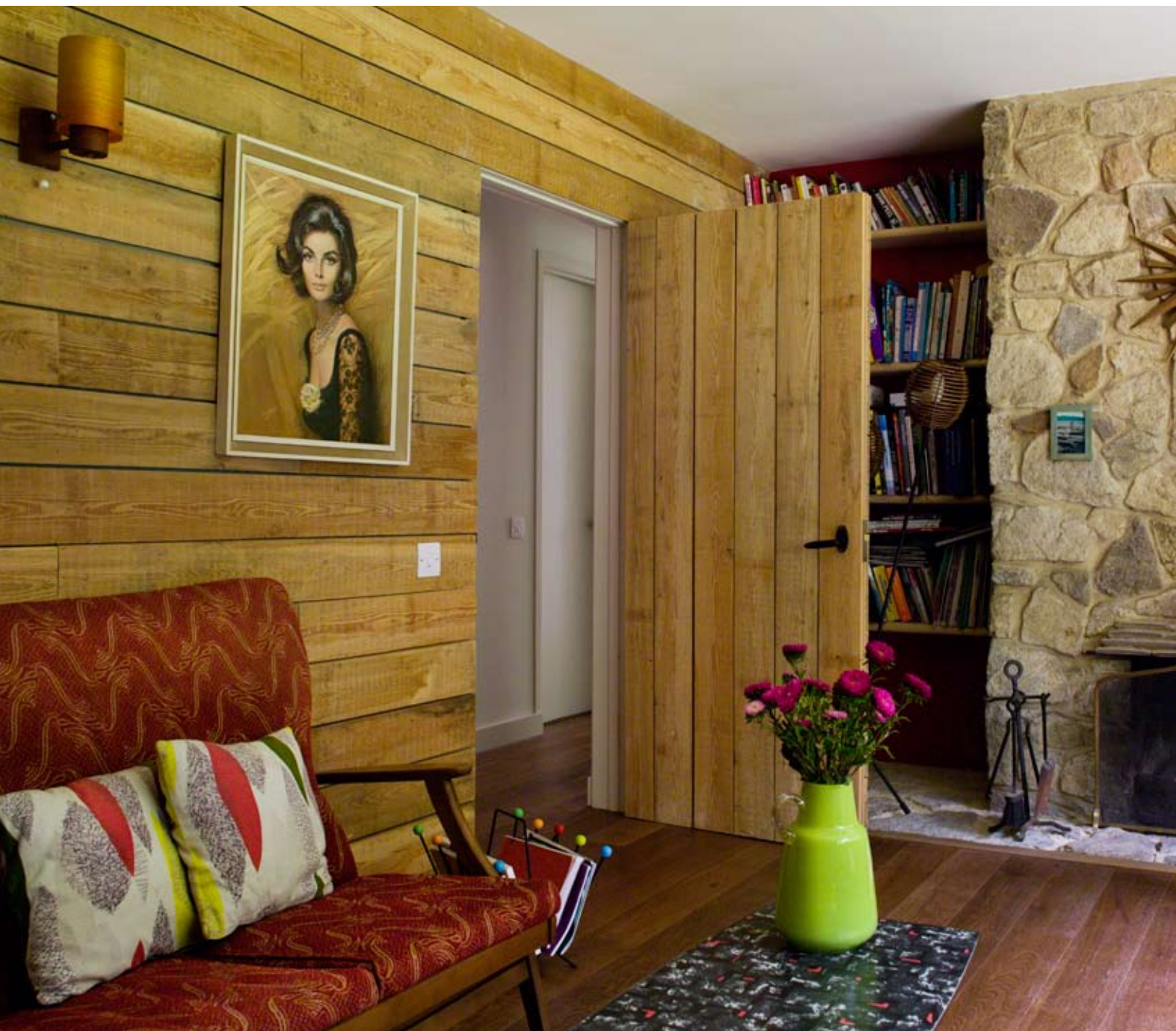
ABOVE Lisa added warmth and colour to the house with a collection of original Fifties and Sixties furniture and textiles, which she picked up at various markets and vintage shops on the island and in London. The stone fire surround is part of the original bungalow

to the dining area and offers a tactile foil to the stunning, ultra-modern steel grey and lime-green kitchen. Throughout the interior, the functional simplicity of the glass, wood and cement structure is softened with colour, vintage flourishes and the hypnotic effect of passing clouds caught in the glass skylight. Lisa has a passion for furniture and prints of the late 1950s and early 1960s, and has a knack for finding them: a treasured pair of Parker Knoll chairs, colourful Lucienne Day cushions and a set of skinny Frank Guille bar stools for Kandya give the house its individuality. A reclaimed parquet floor – a find from a school in Yarmouth – and a battered leather sofa add warmth and texture, and the illusion that the house is already a cherished, lived-in home.